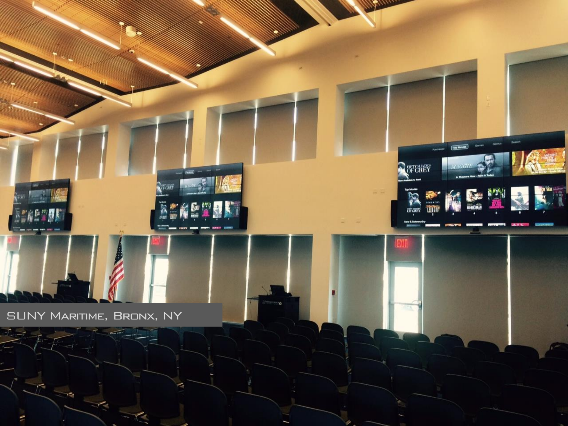
SUNY MARITIME, BRONX, NY