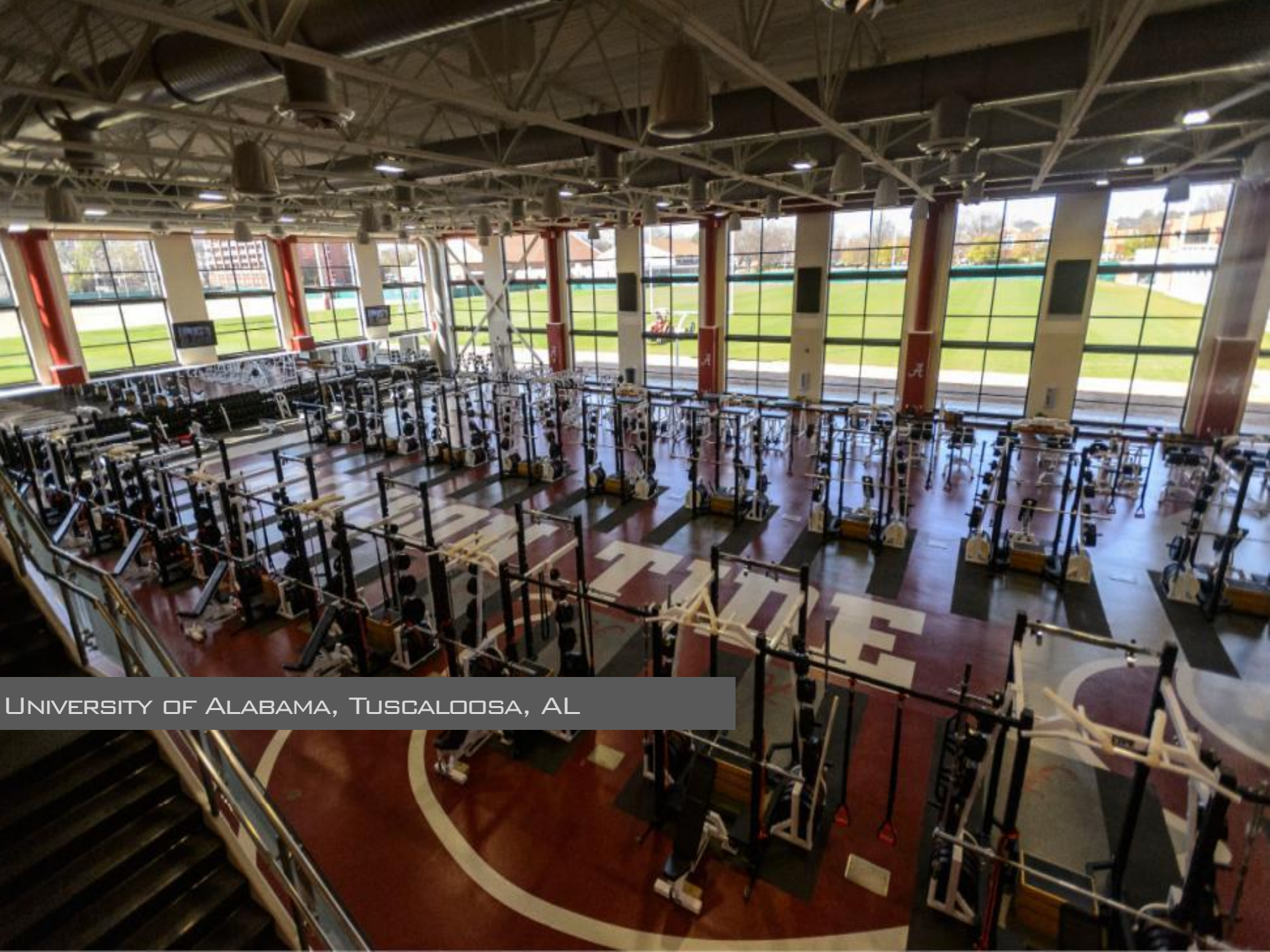
UNIVERSITY OF ALABAMA, TUSCALOOSA, AL